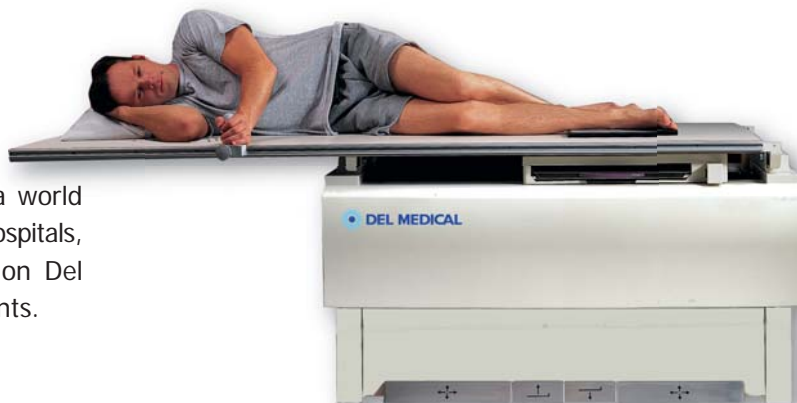
Pictured with EV650 table.