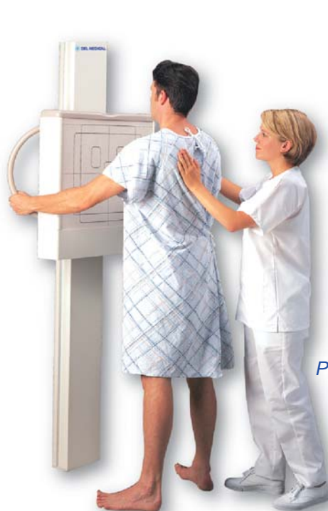
Pictured with VS200 Wallstand.

Whether ambulatory or non-ambulatory, emergency, orthopaedic, pediatric or anything else, DRV™ allows you the flexibility to get exactly what you need.